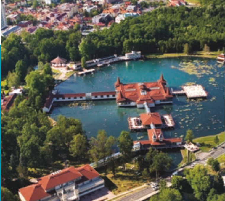
LAKE HEVÍZ – A FORCE OF NATURE